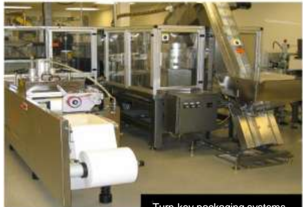
Turn-key packaging systems

Detroit Tool & Engineering Lebanon, MO, Lake Zurich, IL & Shelton, CT