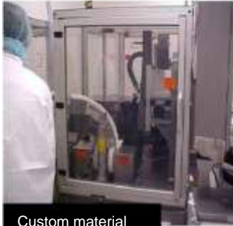
Custom material handling systems

Innovative new products breed potential success in today's marketplace, but getting those products to market may also mean using innovative new processes in your custom packaging and manufacturing environment. Standard "off the shelf" equipment may only be part of the solution or may not be applicable at all in creating the right system for your packaging and production needs. DTE provides a unique blend of engineering professionals along with vertically integrated production facilities staffed with experienced craftsmen to support your efforts in quickly bringing these products to market. Our project teams analyze your needs and offer solutions ranging from system integration of existing technologies, all the way to designing one of a kind systems that provide the unique solutions to your packaging and manufacturing challenges.