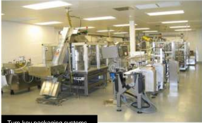
Turn-key packaging systems