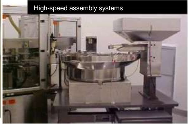
High-speed assembly systems