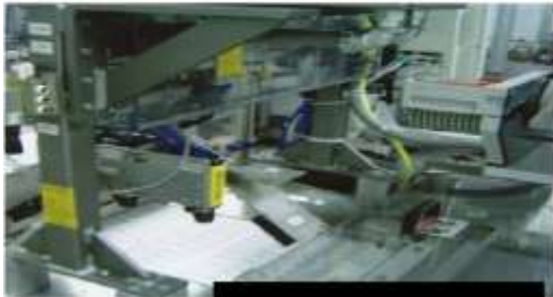
Vision inspection systems