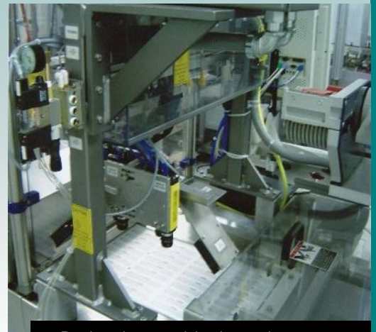
Product damage vision inspection system