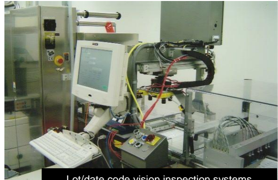
Lot/date code vision inspection systems