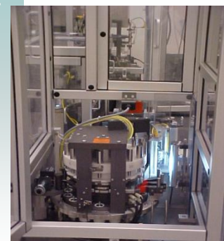
High-speed labeling systems

Operator/Maintenance/Trouble Shooting Commercial Components Complete Mechanical Drawing Package Electrical Schematics Pneumatic Drawings Illustrated Parts List Standard Products PLC Logic/PC programs Drawing Log/Record Hard Copy & Electronic Files