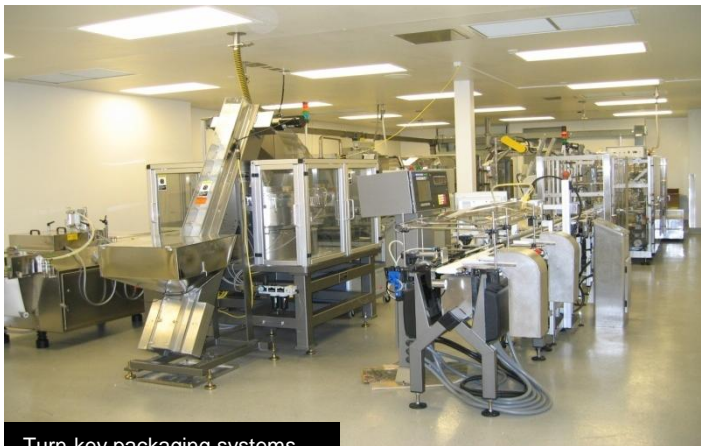
Turn-key packaging systems

Innovative new products breed potential success in today's marketplace, but getting those products to market may also mean using innovative new processes in your manufacturing environment. Standard "off the shelf" equipment may only be part of the solution or may not be applicable at all in creating the right system for your production needs. DTE provides a unique blend of engineering professionals along with vertically integrated production facilities staffed with experienced craftsmen to support your efforts in quickly bringing these products to market. Our project teams analyze your production needs and offer solutions ranging from system integration of existing technologies, all the way to designing one of a kind machines that provide the unique solutions to your manufacturing challenges.