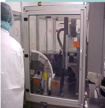
Custom material handling systems

IQ/OQ Qualification Protocol Prepared by DTE Machine Documentation