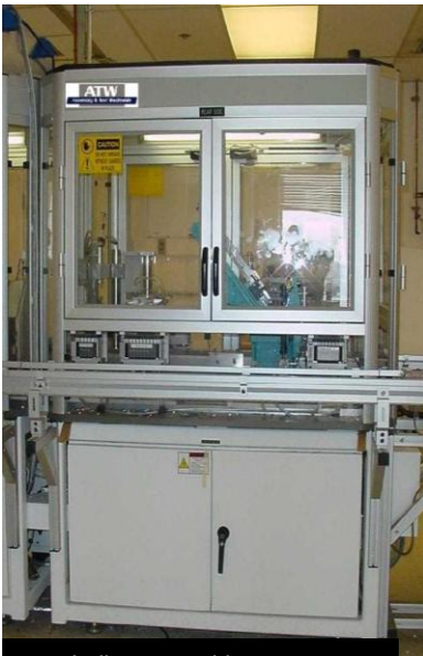
In-line assembly systems

Let our decades of experience assist you in developing proven manufacturing solutions for your automated production of :